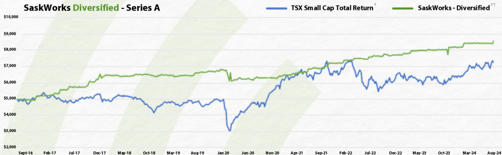
SaskWorks Diversified - Series A